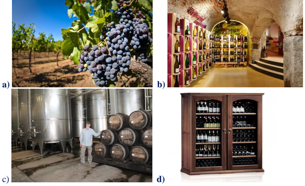
throughout the Yarra Valley, located a short drive from Melbourne.

For wine and food aficionados, South Australia is home to Australia's world-famous wine region. You can tour 12 ) wineries